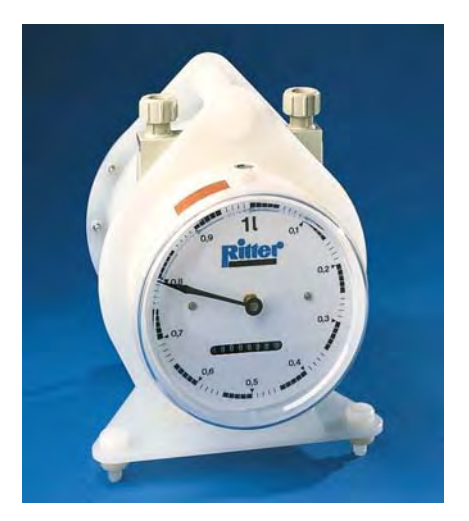
TG 1 Model 7 (PVDF)