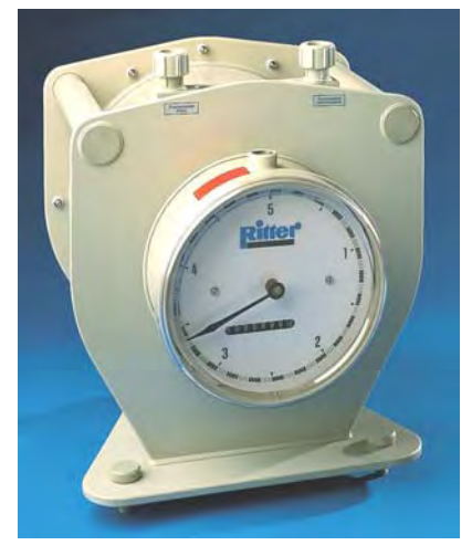
TG 5 Model 6 (PP)