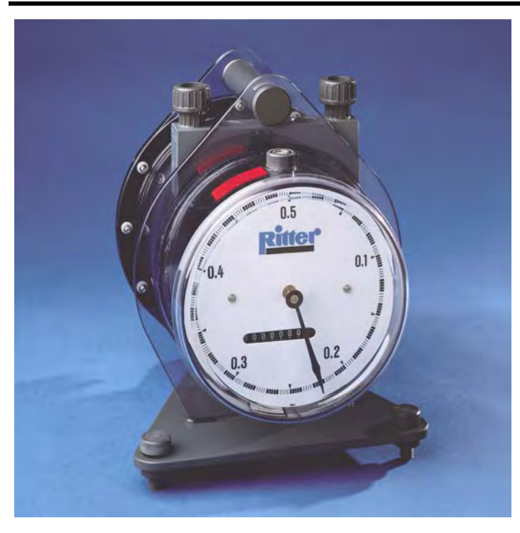
TG 05 Model 5 (PVC transparent)